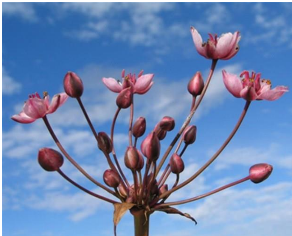
ABOVE: Flowering rush flower close-up LEFT: Flowering rush plant

Flowering rush is a cattail-like perennial of freshwater wetlands. It is native to Africa, Asia and Europe 1 and was likely introduced to North America as an ornamental plant. It is the only member of the Butomaceae family and is able to reproduce both by seed and vegetatively (rhizomatous roots form bulblets which separate from the parent plant 3 ). Flowering rush infestations can displace native vegetation and result in reduced water quality which may disrupt valuable fish and wildlife habitat. Dense stands in irrigation ditches can reduce water availability, and in lakes can interfere with boat propellers and swimming. 3 Plants flower summer to fall. 1 Flowers are hermaphroditic (contain both male and female organs) and are pollinated by bees, flies and butterflies. 2